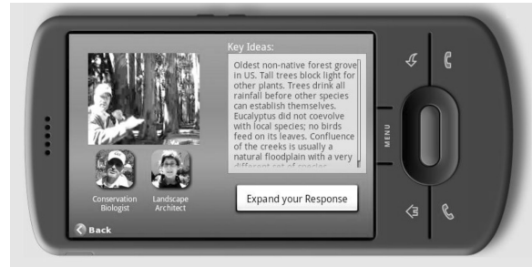
Fig. 4. Screenshot of Expert Videos with Key Concepts in Text in the GreenHat Mobile Prototype.

Our evaluation of the GreenHat prototype with college students showed that having access to multiple experts' perspectives in the physical environment, i.e., how the experts would look at and interrogate the very environment the students