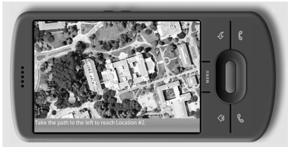
Fig. 2. Screenshot of Interactive Location-Sensitive Map in the GreenHat Mobile Prototype.