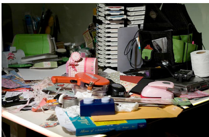
Figure 4: While a desk's surface is often cluttered, its edges are under-used.

Page tabs are the material that attaches to individual pages in order to help us organize the contents of our books. Unlike bookmarks that materialize as strings or ribbons, tabs are most often made of page-like material that is just large enough to be pinched by a thumb and forefinger. Using such tabs, pages can seem to 'jump out' of the side of a book, indicating where the marked page is located. By calling attention to points along the depth of a book, we can get a sense of where we have left marks, rather unconsciously differentiating the marked content using our spatial memory.