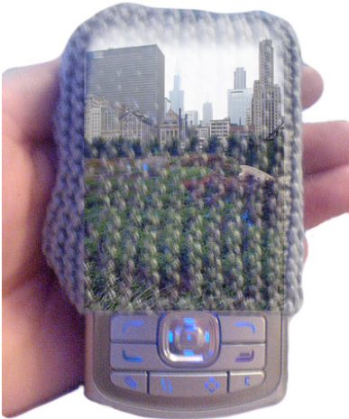
Figure 5: A device jacket can present personal information while protecting the device from nicks and scratches.

Concept: The counters in a kitchen are mutable surfaces: the chef can temporarily change the topology of cooking surfaces, adjusting their function and form.