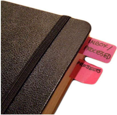
Figure 3: Designers can leverage the sides of an object to spatially orient the user, as demonstrated by tabs on the sides of books, spines, and pages.

A woman wishes to control the presentation of one of her most-used possessions—her cell phone. Her friends personalize the surfaces of their cell phones, music players and PDAs with a variety of materials, from colored plastic covers to hand-knit cozies. While presenting a modified exterior, these displays are static and fail to reflect their changing social environment. The woman decides to place a Dynamic Jacket around her phone, and customizes its display. She adjusts the jacket's settings to exhibit collections of digital images: when the phone is idle, the jacket loops through images from her Flickr.com photo stream; when a friend calls, the jacket displays images from the friend's Flickr.com stream. The jacket simultaneously protects her device while presenting a visual narrative of digital images: she receives implicit visual updates on her friends' activities and finds unexpected images within her own digital archive. The device jacket, thus, becomes a subtle representation of the woman and her friends' mood, interests, and activity.