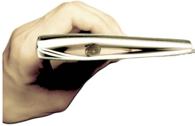
Figure 1: People can use a variety of tools and techniques to mark pages of a notebook.