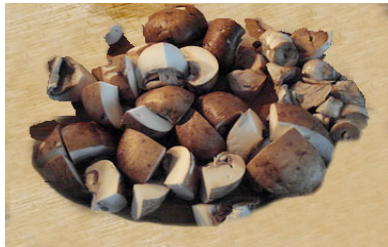
Figure 3: A malleable countertop allows the chef to create surface crevasses to hold each cooking ingredient.

Historian Lorraine Daston believes we should analyze diverse aspects of books in order to understand how scientific ideas have been formed. She describes studying differences in various book editions, their print runs, format, distribution, and hints of reading implied by folding, ripping, and annotation in margins [3].