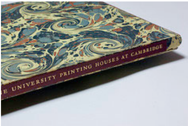
Figure 4: A book jacket's surface protects the internal pages while making external information public.